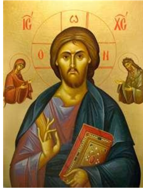
Jesus Christ – God in the Flesh